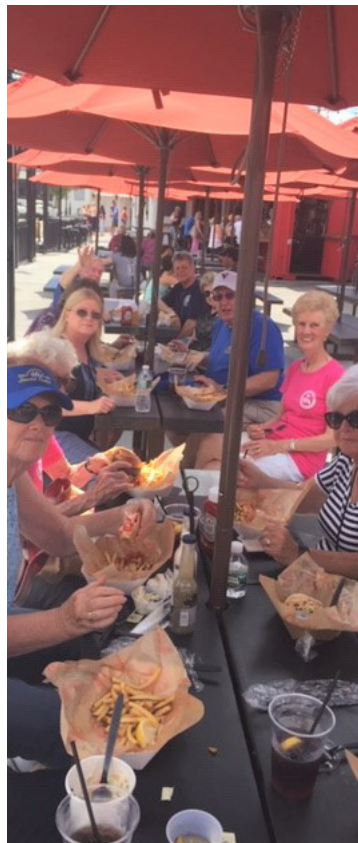
Dining out is more fun with friends.

Fall is a great time to join the Sandel Center! Enjoy fitness classes, learning opportunities, trips, volunteerism, guest speakers, games, and more. Adults age 60 plus, from Rockville Centre and the surrounding communities are encouraged to visit the center and see what it has to offer. For information please call 678-9245 or visit our website: www.rvcny.gov and follow the link to Senior Citizens.