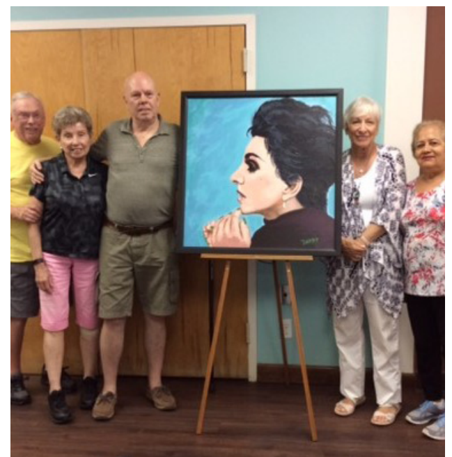
Guest speakers with a broad range of topics are featured regularly.