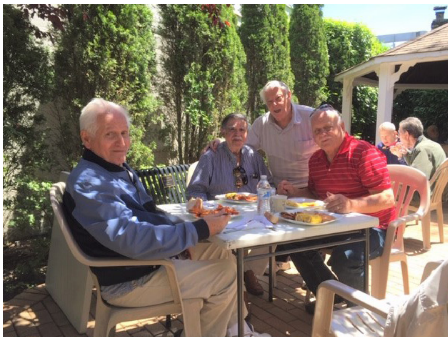
Sandel Senior Men's Club summer barbeque.